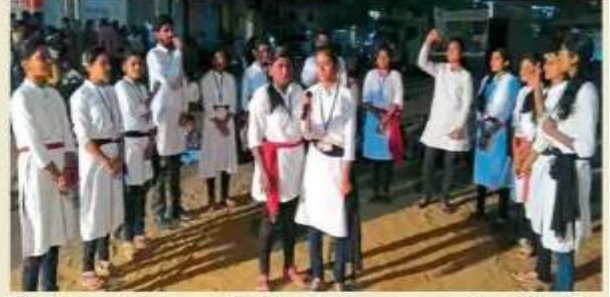
येणेगूर (ता. उमरगा) : मतदार जनजागृतीसाठी पथनाट्य सादर करताना जवाहर महाविद्यालयाचे विद्यार्थी.